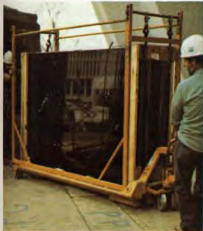
98" truck with special superstructure mounted on forks, designed for PPG Industries.

Featured on this page are representative models of the hundreds of specially designed PALLET MULES in use in the USA and abroad.