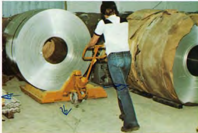
10,000 lb. capacity trucks designed for U.S. Aluminum & Steel Highway Products Co., one of which is a three fork truck.