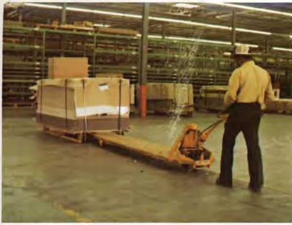
10,000 lb. capacity, 120" truck with automotive type brake designed for Formica Corporation.