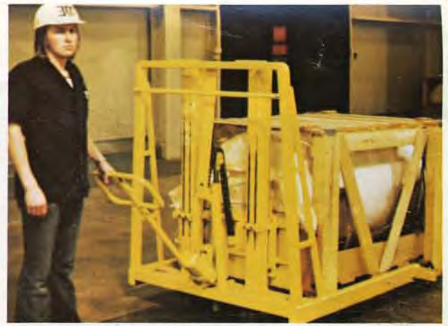
5,000 lb. capacity, 36" lift truck designed for 3M Company.